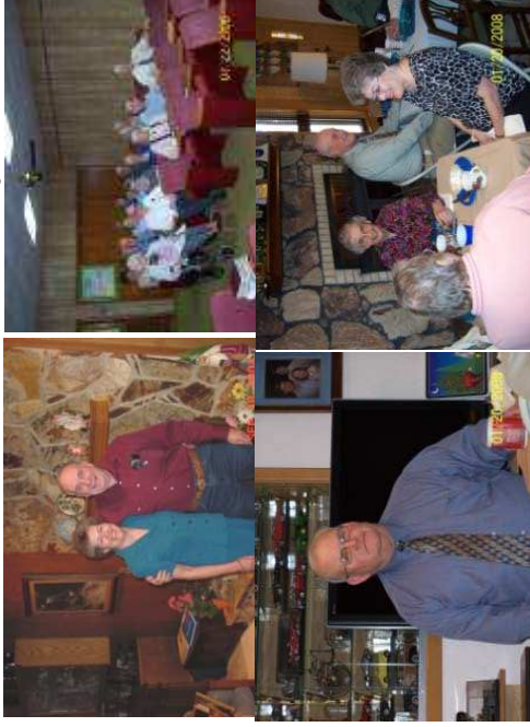
Your Brethren at Booker, TX